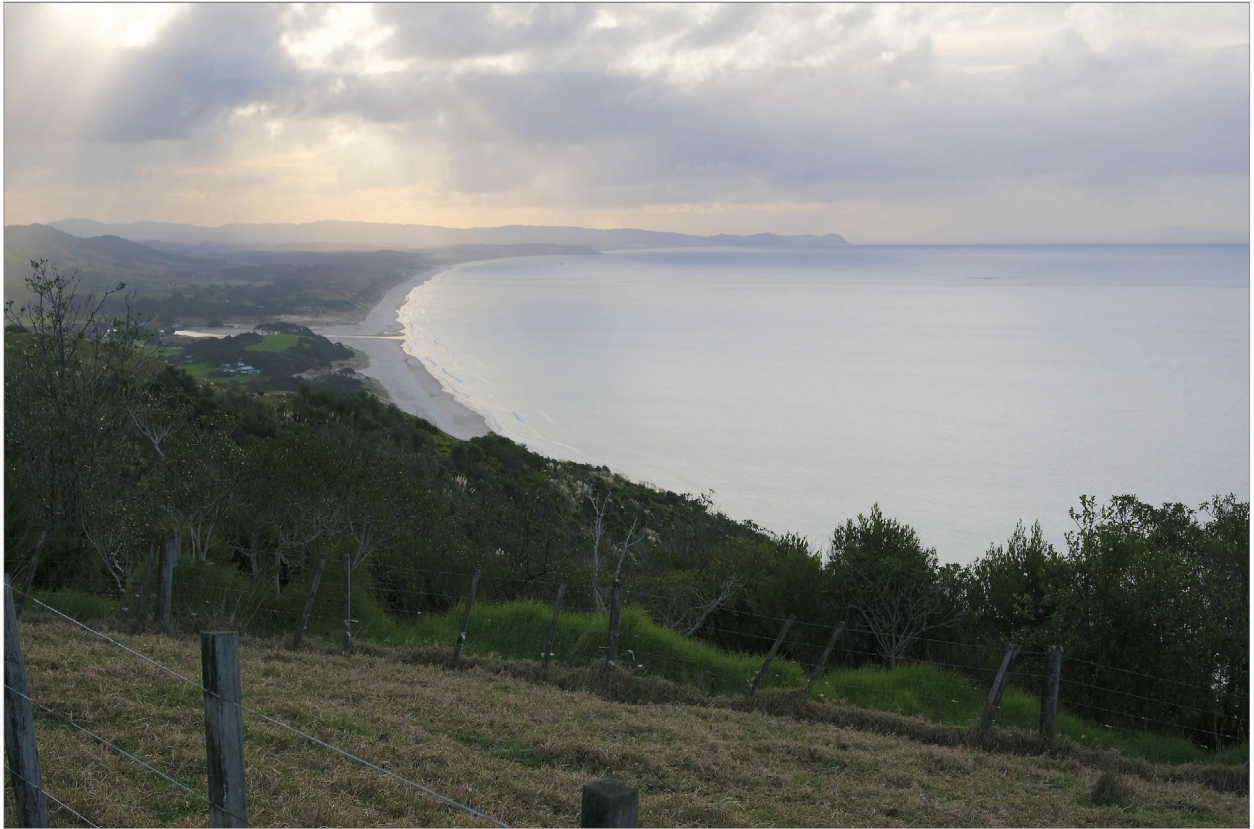
McCALLUM BROTHERS LIMITED SAND VIEWPOINT 12. (PHOTO) EXTRACTION APPLICATION: 15-25m Looking from M Greenwood Road (Pakiri Regional Park) towards the Coastal Carrier at the 10m contour off Pakiri Beach Brown 102.102 March 2020