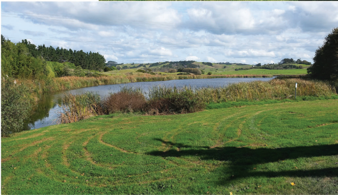
Looking across Spectacle Lake towards Tomarata Lake (above) & across Slipper Lake from Ocean View Rd (left)