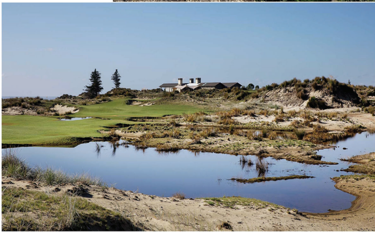
Looking towards the cleared area of the golf course and cottages from Te Arai Point