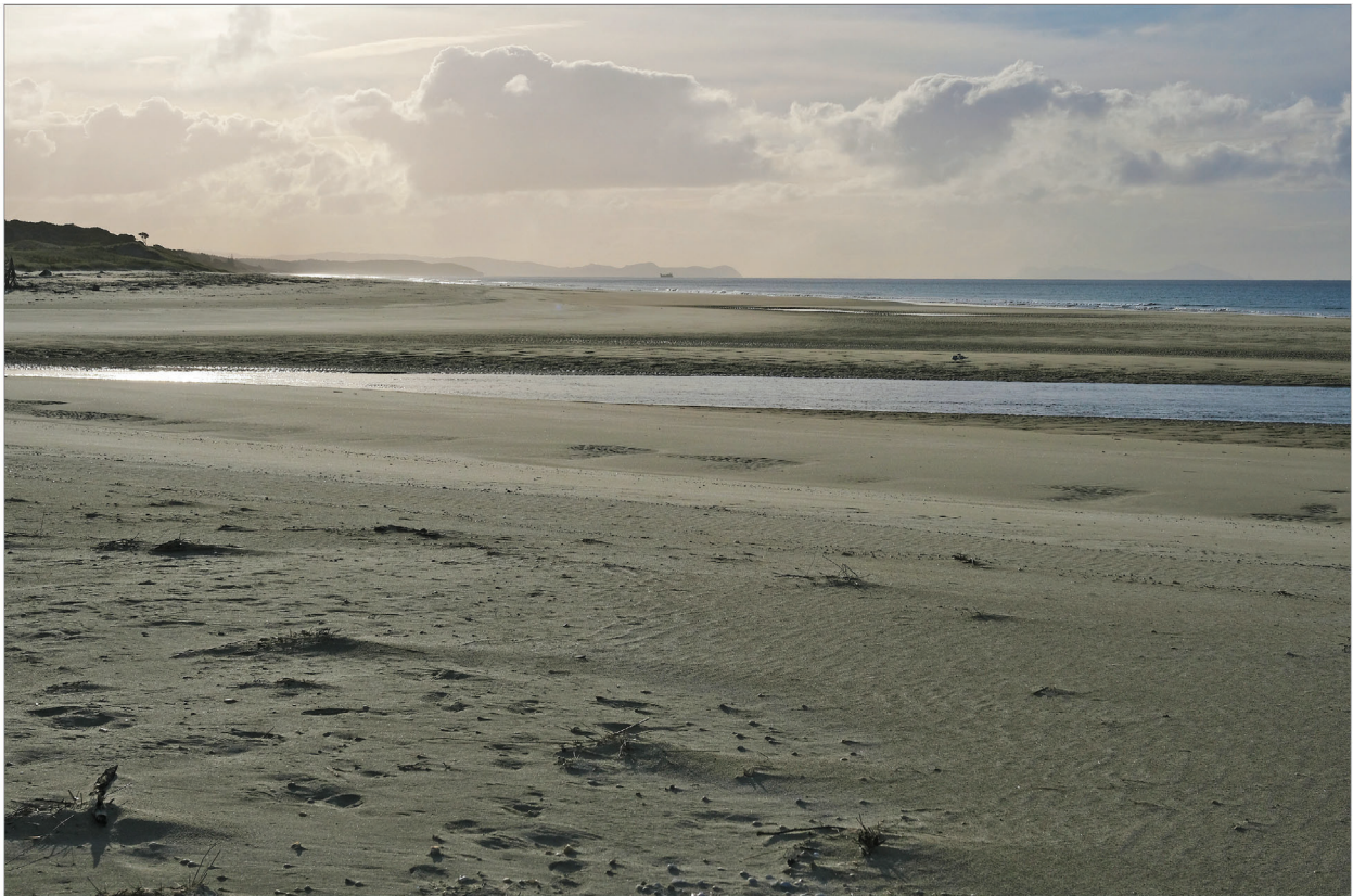
McCALLUM BROTHERS LIMITED SAND VIEWPOINT 11. (PHOTO) EXTRACTION APPLICATION: 15-25m Looking from near the edge of the Pakiri River & beachfront towards the Coastal Carrier at the 10m contour off Pakiri Beach Brown NZ Ltd March 2020